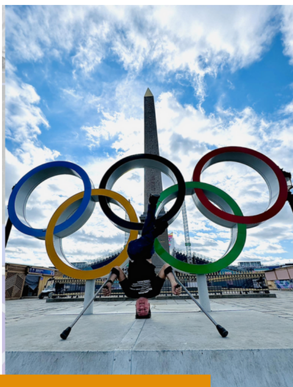
OLYMPICS & PARALYMPICS, PARIS